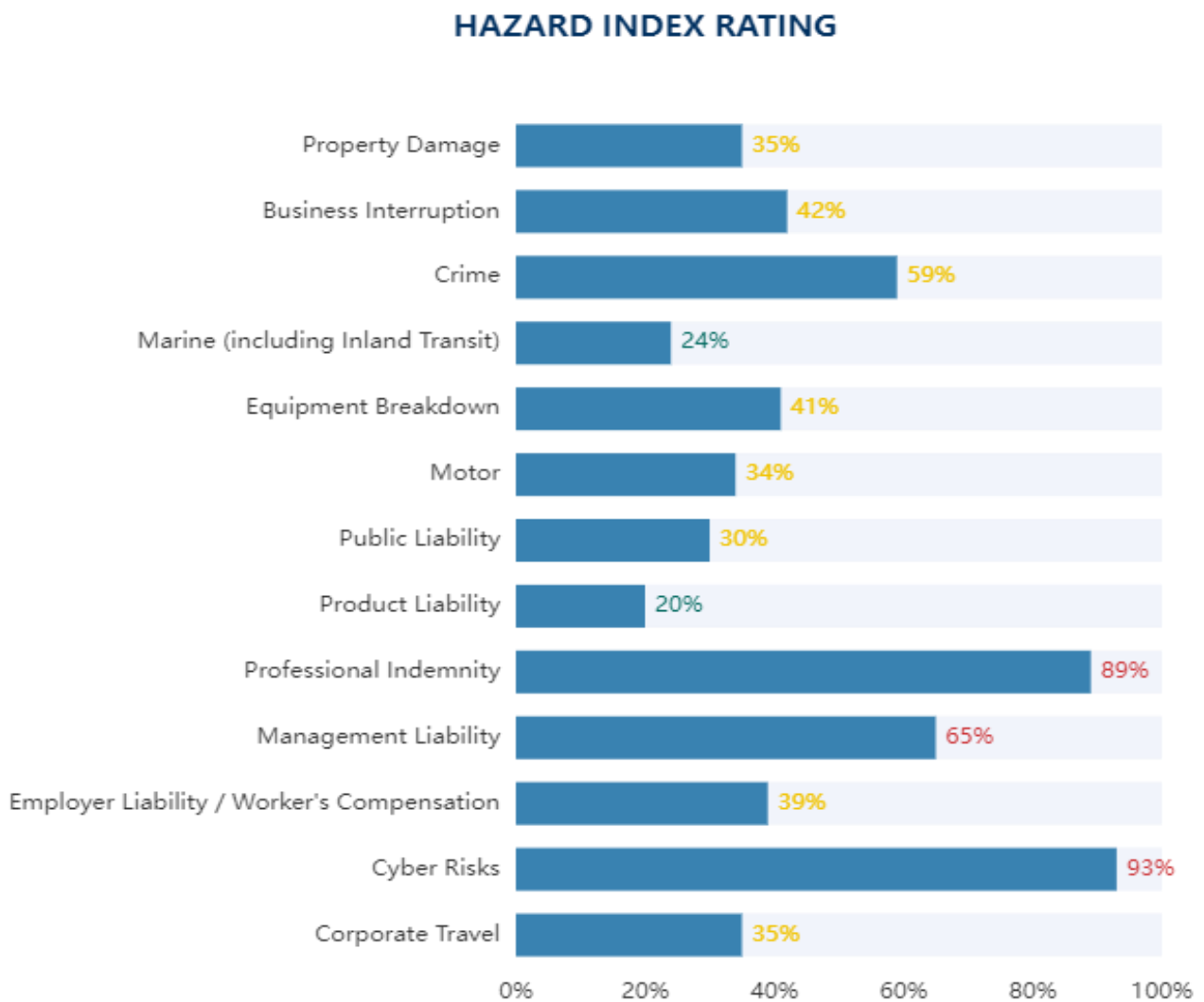
Fig 1: Hazard Index

Identifying hazards in the workplace involves finding things and situations that could potentially cause harm to the organisation. The following chart is a graphical representation of the likelihood and severity of a loss occurring within any of the classes of insurance listed in the chart.